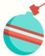
Broken Christmas decorations

Reduce or reuse. Cannot be recycled, place in garbage.